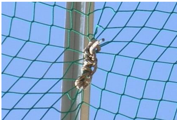
Figure 2. Temporary repair to a Safety Net

There shall be no more than two temporary repairs carried out in any one Safety Net and any damage can be no greater than three mesh strands. The repair rope shall be of Type O or Type M (typically a tie rope is used).